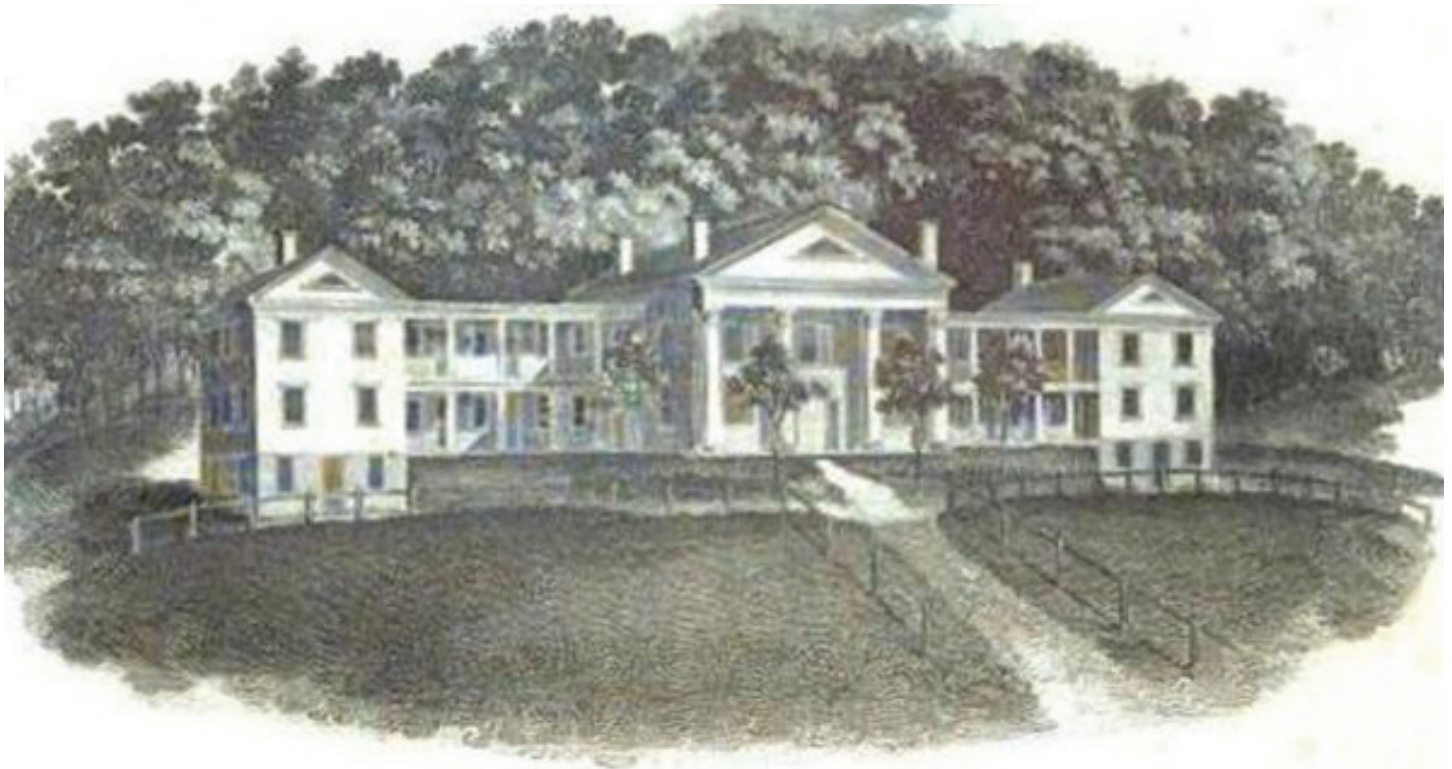
THE MOUNT PLEASANT CLASSICAL INSTITUTION. AMHERST, MASS.