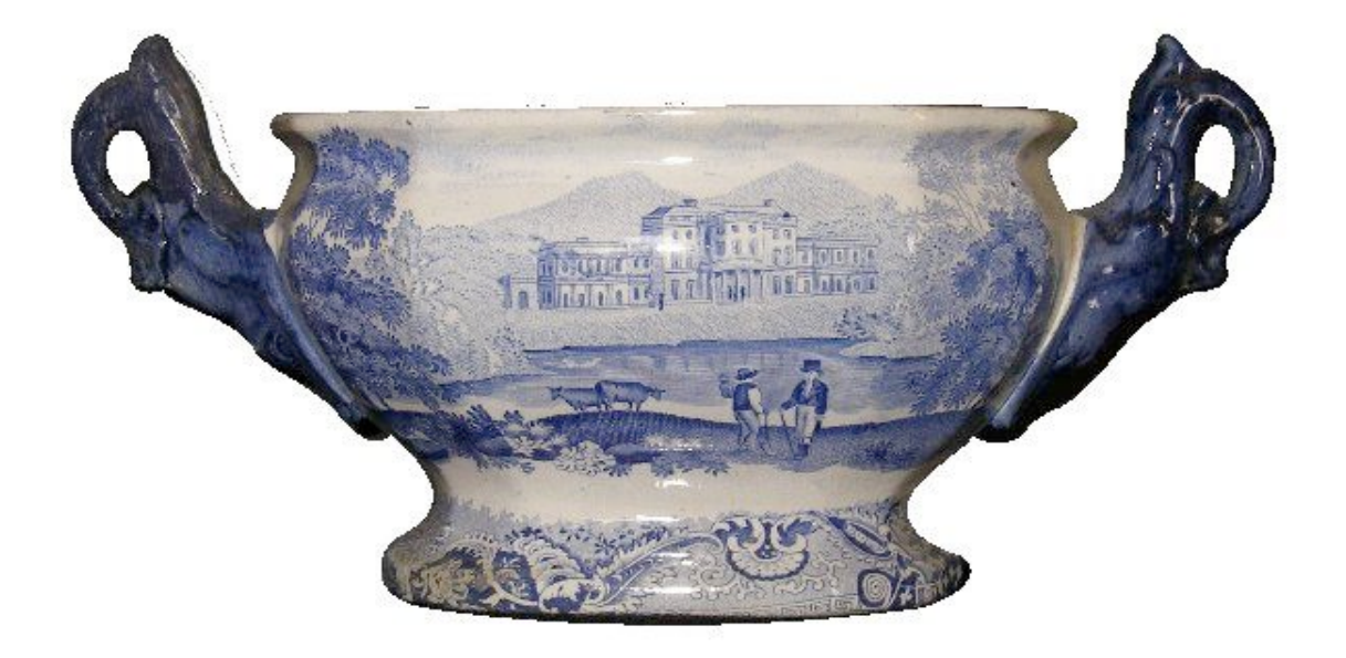
Fig. 1 - "The Haining, Selkirkshire" sauceboat