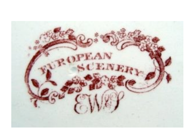
Fig. 8 – "European Scenery" mark

For the last look at a scene that is out of place, we go a little farther afield with Enoch Wood's European Scenery, the usual mark for which is pictured here (Figure 8). This is a large series, well represented in the database although there is no telling how many views there actually are. Most of them are still unidentified, but one stands out as looking distinctly non-European. It is on a 10.5 inch plate, and actually pictures Jumma Musjid, Agra (Figure 9), a mosque in India. The source print (Figure 10) is from the book "Views in the East", published in 1833 and based on drawings by Robert Eliot.