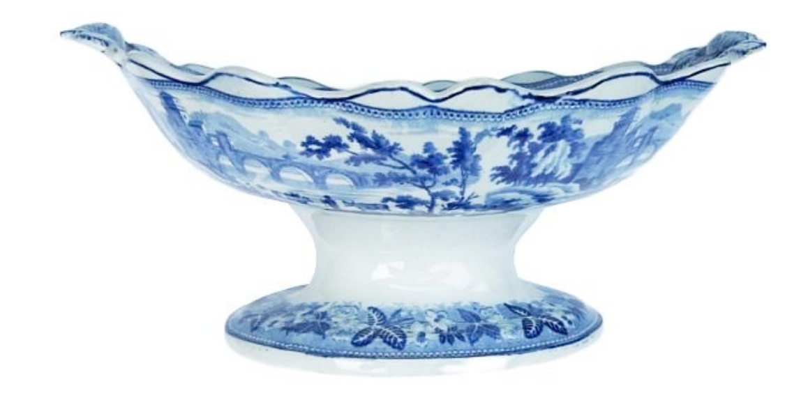
Fig. 7 – "Ponte Molle" comport

For the last look at a scene that is out of place, we go a little farther afield with Enoch Wood's European Scenery, the usual mark for which is pictured here (Figure 8). This is a large series, well represented in the database although there is no telling how many views there actually are. Most of them are still unidentified, but one stands out as looking distinctly non-European. It is on a 10.5 inch plate, and actually pictures Jumma Musjid, Agra (Figure 9), a mosque in India. The source print (Figure 10) is from the book "Views in the East", published in 1833 and based on drawings by Robert Eliot.