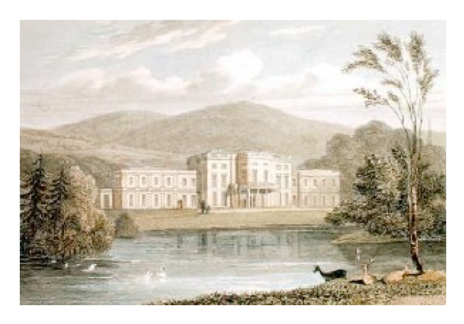
Fig. 2 – "The Haining" source print