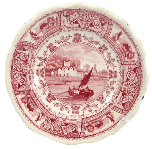
Fig. 4 – "Guy's Cliff" plate