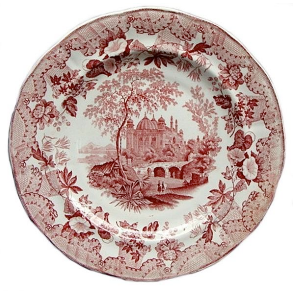
Fig. 9 – "Jumma Musjid, Agra" plate